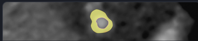
Clearly — soft, non-calcified plaque a calcium score misses

For those who are prediabetic, fighting stubborn weight, or focused on healthspan — continuous glucose monitoring and insulin-sensitivity testing, reviewed through the year.